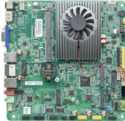
ITX-N100 Front View